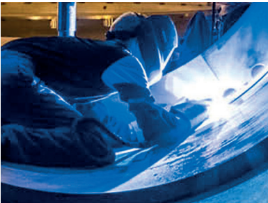
TIG welding of stainless steel