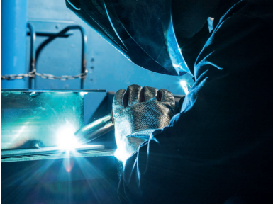
MIG welding of aluminium

The high performance gas shielding solution for TIG and MIG welding of all materials